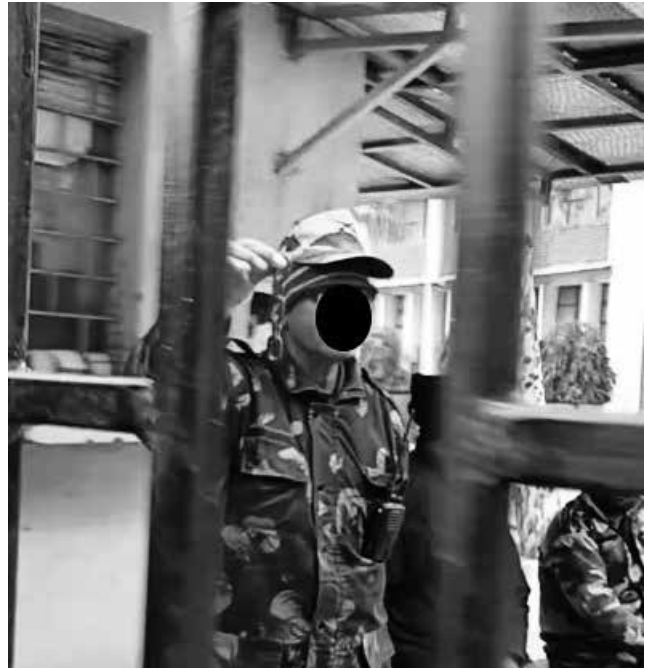
Guard holding up broken lock and chain from forced entry at Gate 4

Upon entering from these three gates, the forces blocked entry and exit, took over all the pathways surrounding the polytechnic building area leading